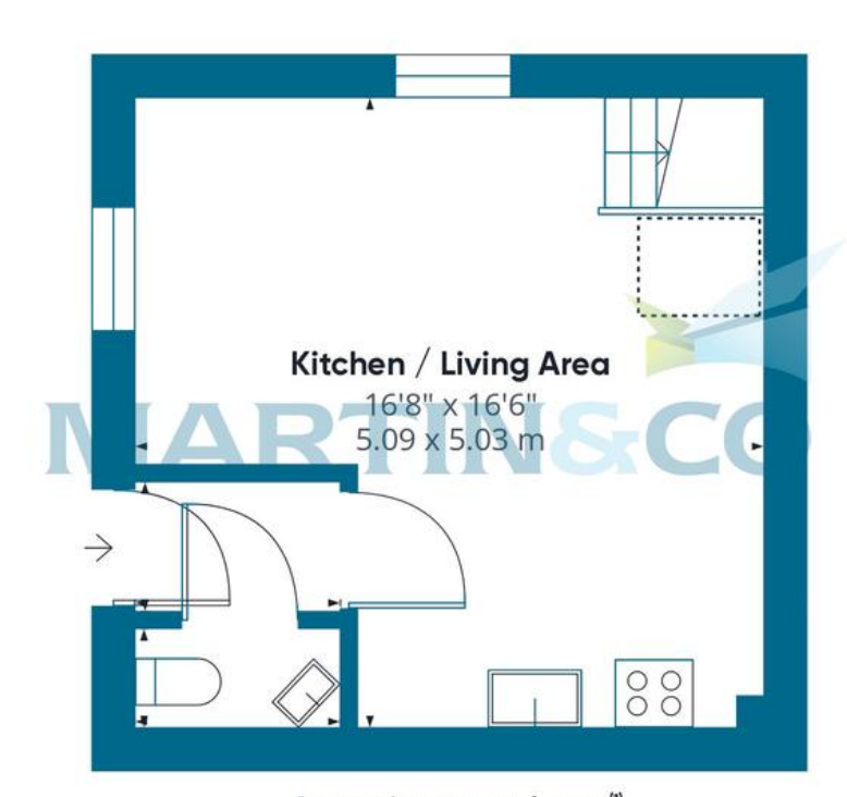
Approximate total area(1)

503.03 ft<sup>2</sup> 46.73 m<sup>2</sup>