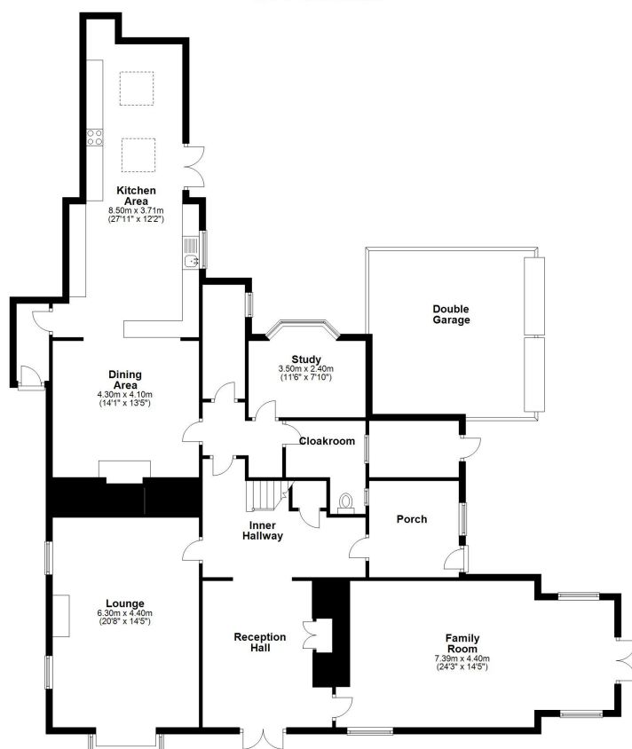
Ground Floor Area (Not Including Garage) Approx. 185.5 sq. metres (1997.0 sq. feet)