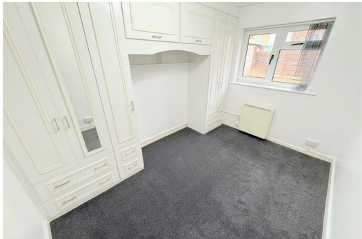
1 St. Margarets Road, Prestwich, Manchester, M25 2QB