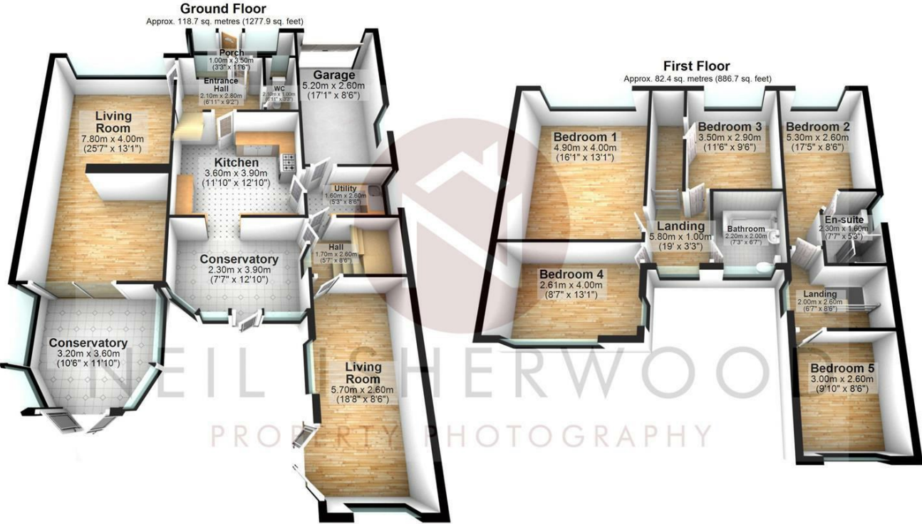
Total area: approx. 201.1 sq. metres (2164.5 sq. feet) This floor plan was created by Neil Isherwood Property Photography. This is not to scale, all measurements are made with a laser measure to be as accurate as possible, but we hold no responsibility for any errors. Plan produced using PlanUp.