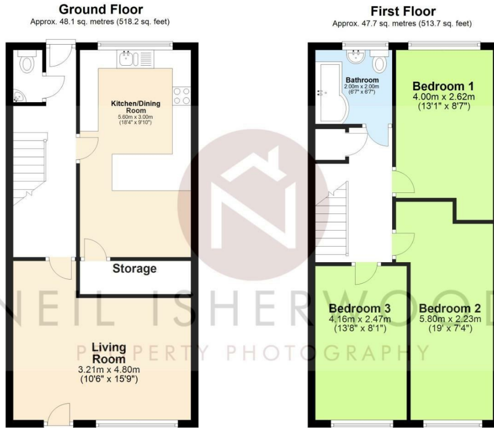
Ground Floor Approx. 48.1 sq. metres (518.2 sq. feet)