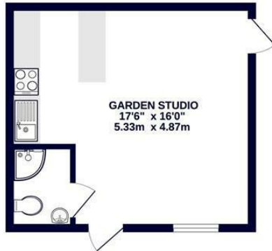
OUTBUILDING 279 sq.ft. (25.9 sq.m.) approx.