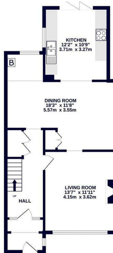
GROUND FLOOR 636 sq.ft. (59.1 sq.m.) approx.