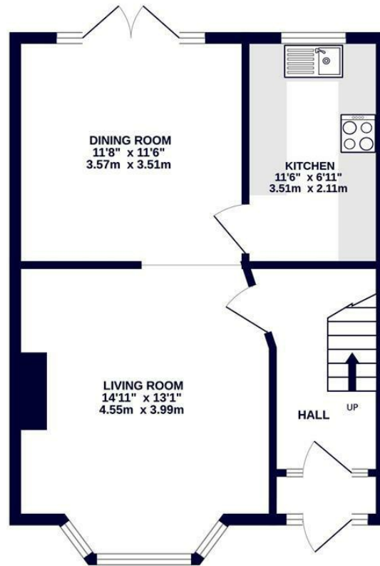
GROUND FLOOR 506 sq.ft. (47.0 sq.m.) approx.