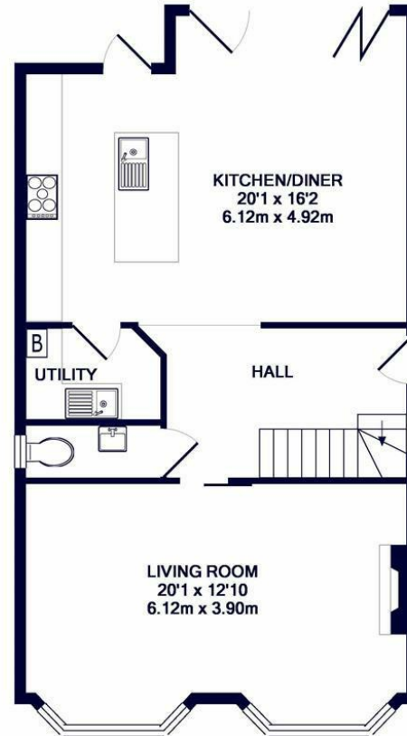
GROUND FLOOR APPROX. FLOOR AREA 707 SQ.FT. (65.7 SQ.M.)