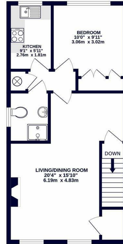
TOTAL FLOOR AREA: 539 sq.ft. (50.1 sq.m.) approx.

Whilst every attempt has been made to ensure the accuracy of the floorplan contained here, measurements of doors, windows, rooms and any other items are approximate and no responsibility is taken for any error, omission or mis-statement. This plan is for illustrative purposes only and should be used as such by any prospective purchaser. The services, systems and appliances shown have not been tested and no guarantee as to their operability or efficiency can be given. Made with Metropix ©2023