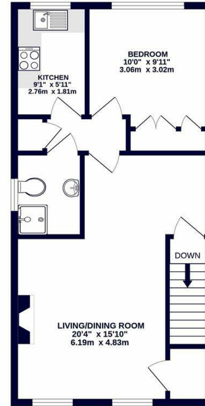
TOTAL FLOOR AREA : 539 sq.ft. (50.1 sq.m.) approx.

Whilst every attempt has been made to ensure the accuracy of the floorplan contained here, measurements of doors, windows, rooms and any other items are approximate and no responsibility is taken for any error, omission or mis-statement. This plan is for illustrative purposes only and should be used as such by any prospective purchaser. The services, systems and appliances shown have not been tested and no guarantee as to their operability or efficiency can be given. Made with Metropix i3002