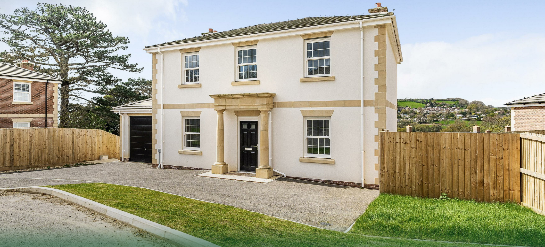
The Anning 7 Monmouth Park, Lyme Regis, Dorset