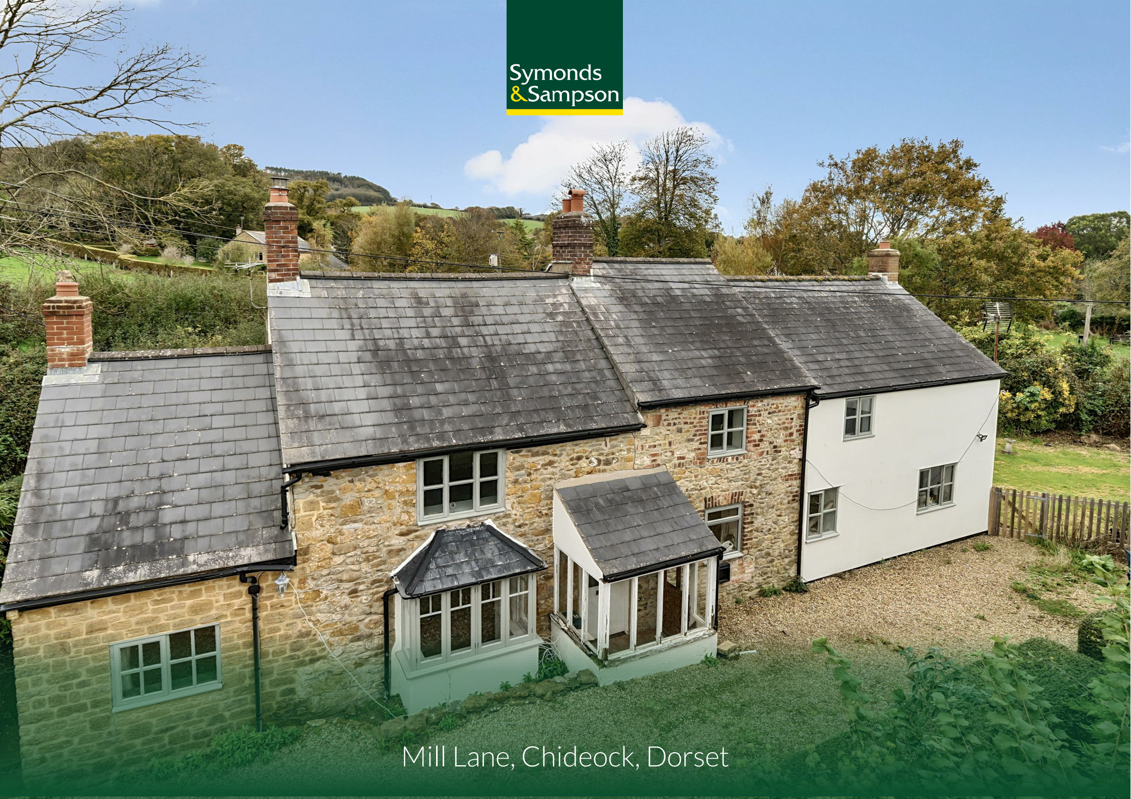
Mill Lane, Chideock, Dorset