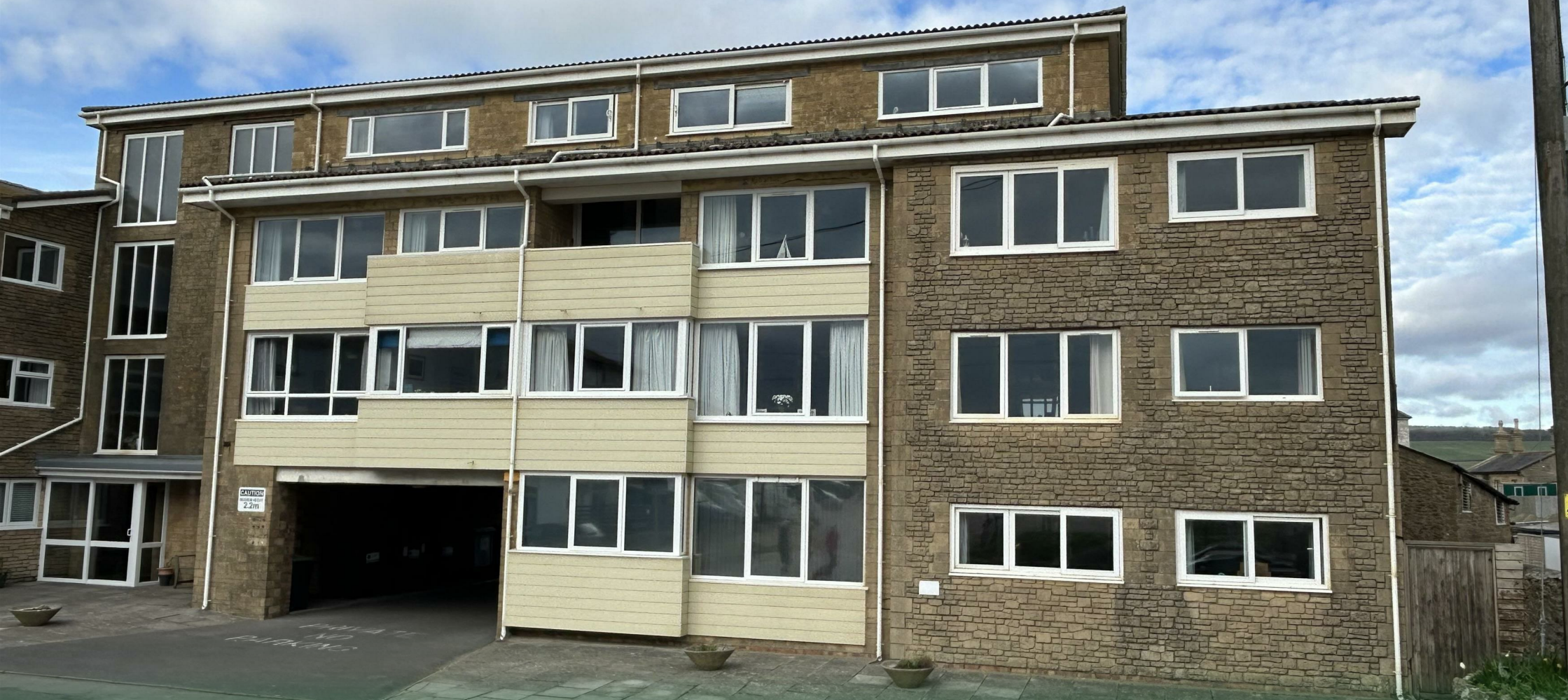
Chesil House Station Road, West Bay, Bridport, Dorset