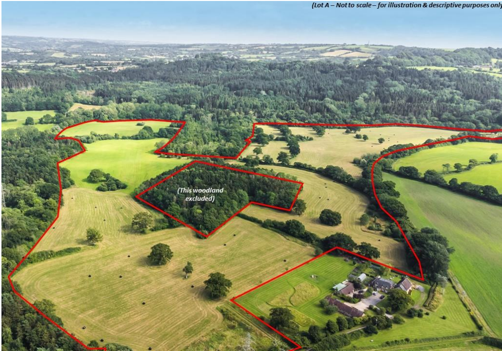
(Lot A – Not to scale – for illustration & descriptive purposes only)