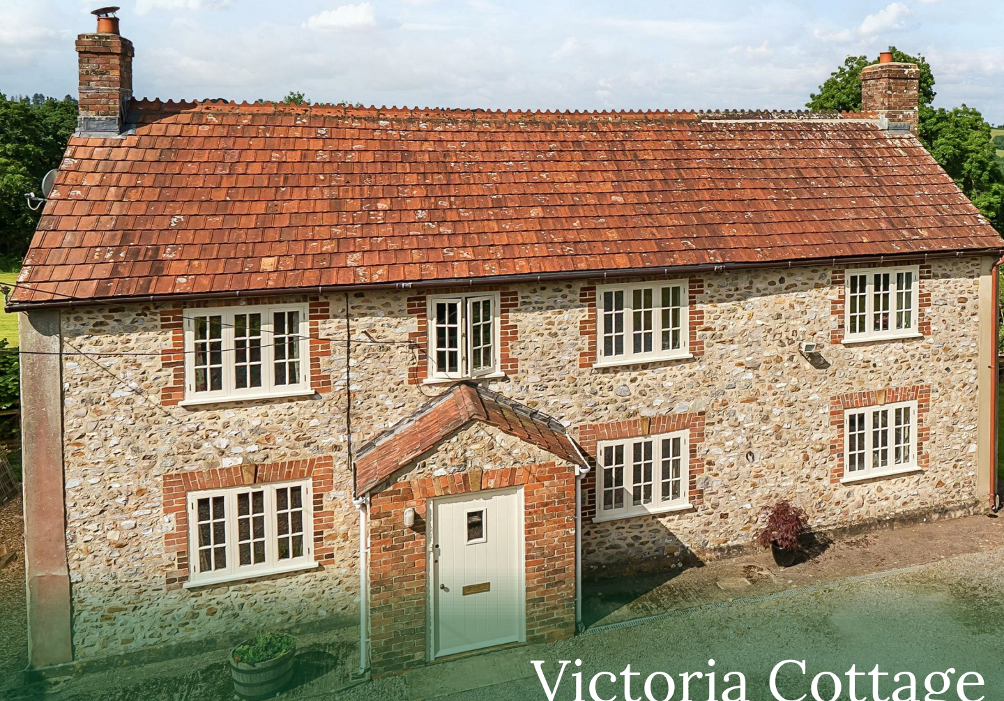
Victoria Cottage 2 Coles Cross, Blackdown, Beaminster, Dorset