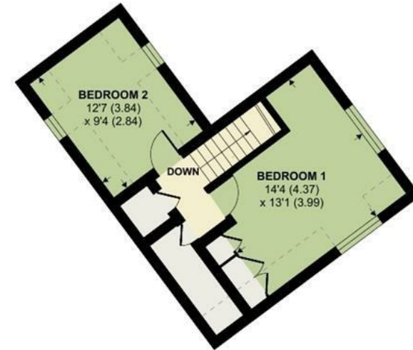
ANNEXE FIRST FLOOR