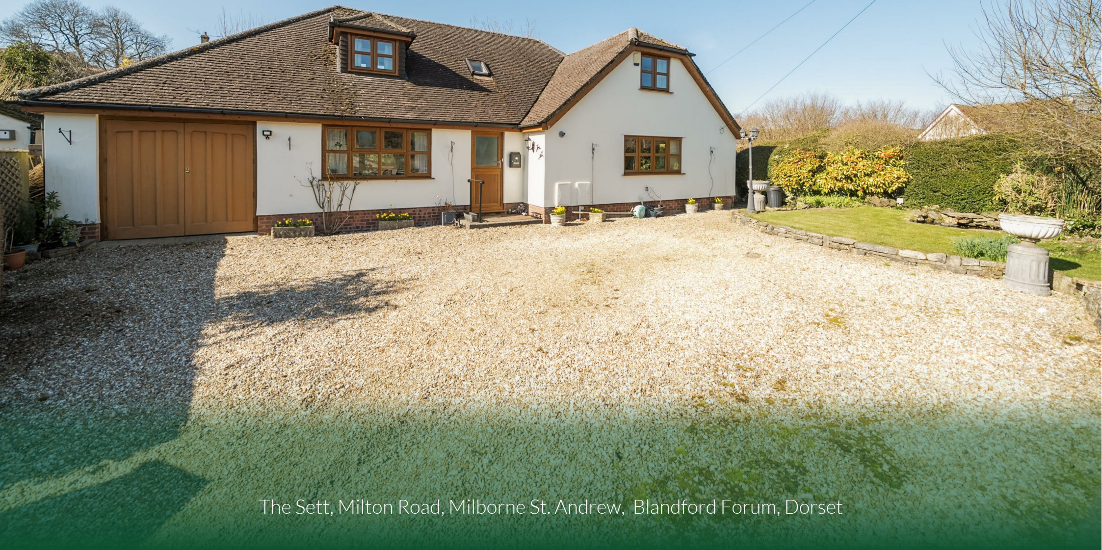
The Sett, Milton Road, Milborne St. Andrew, Blandford Forum, Dorset