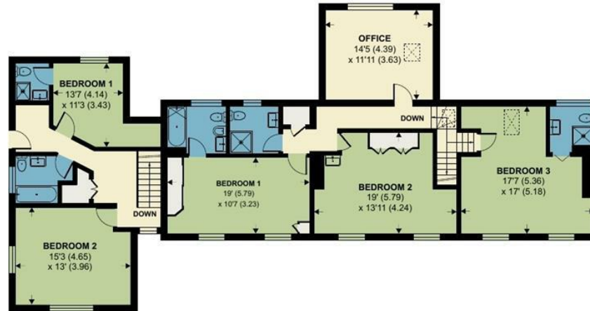
FIRST FLOOR / ANNEXE FIRST FLOOR