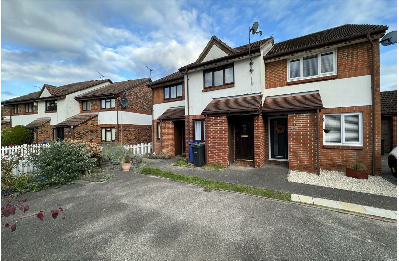
Gabion Avenue, Purfleet