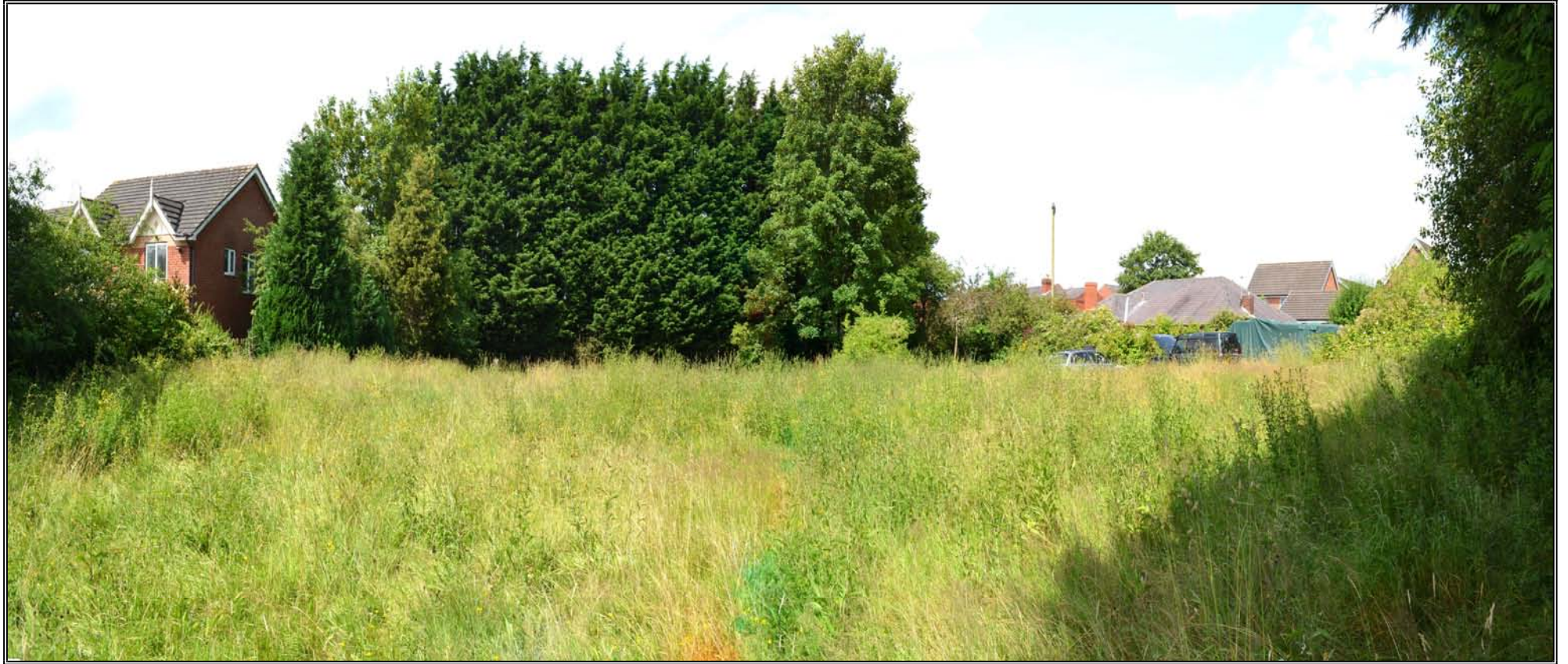
Residential Development Land, Hornby Road, off Quarry Road, Chorley, PR6 0LT