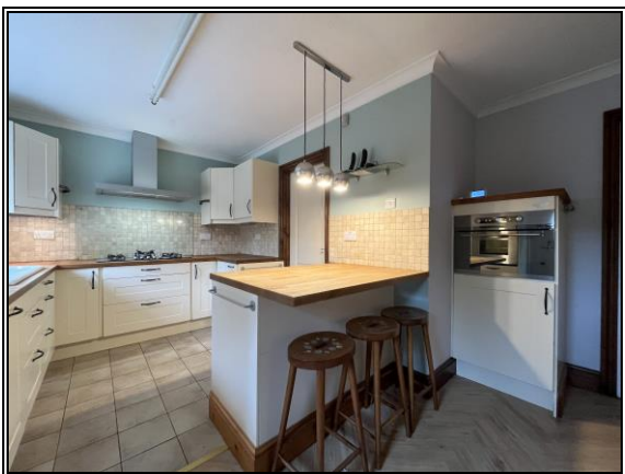
Kitchen - View 1