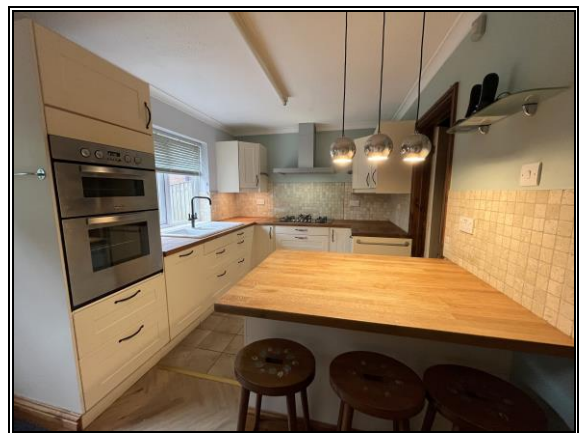
Kitchen - View 2