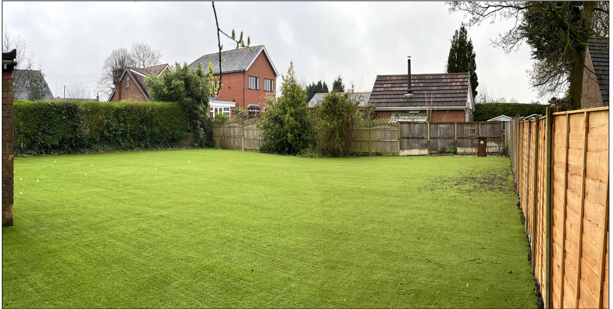
Building Plot, forming part of Malasia, Park Avenue, New Longton, Preston, PR4 4AY