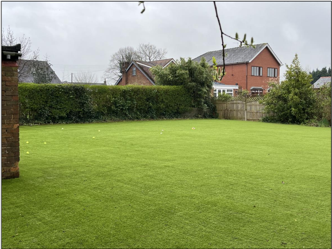
Building Plot, forming part of Malasia, Park Avenue, New Longton, Preston, PR4 4AY