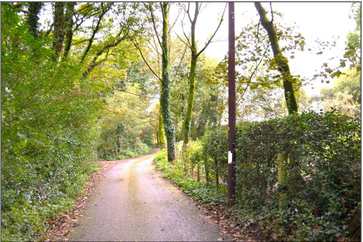
Building Plot at Hill Park, Hill Top Lane, Whittle-le-Woods, Chorley, PR6 7QS