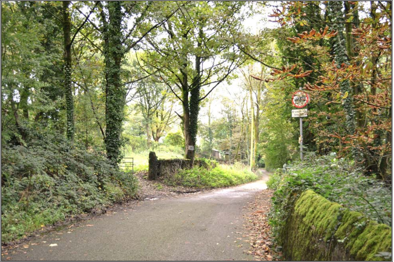
Building Plot at Hill Park, Hill Top Lane, Whittle-le-Woods, Chorley, PR6 7QS