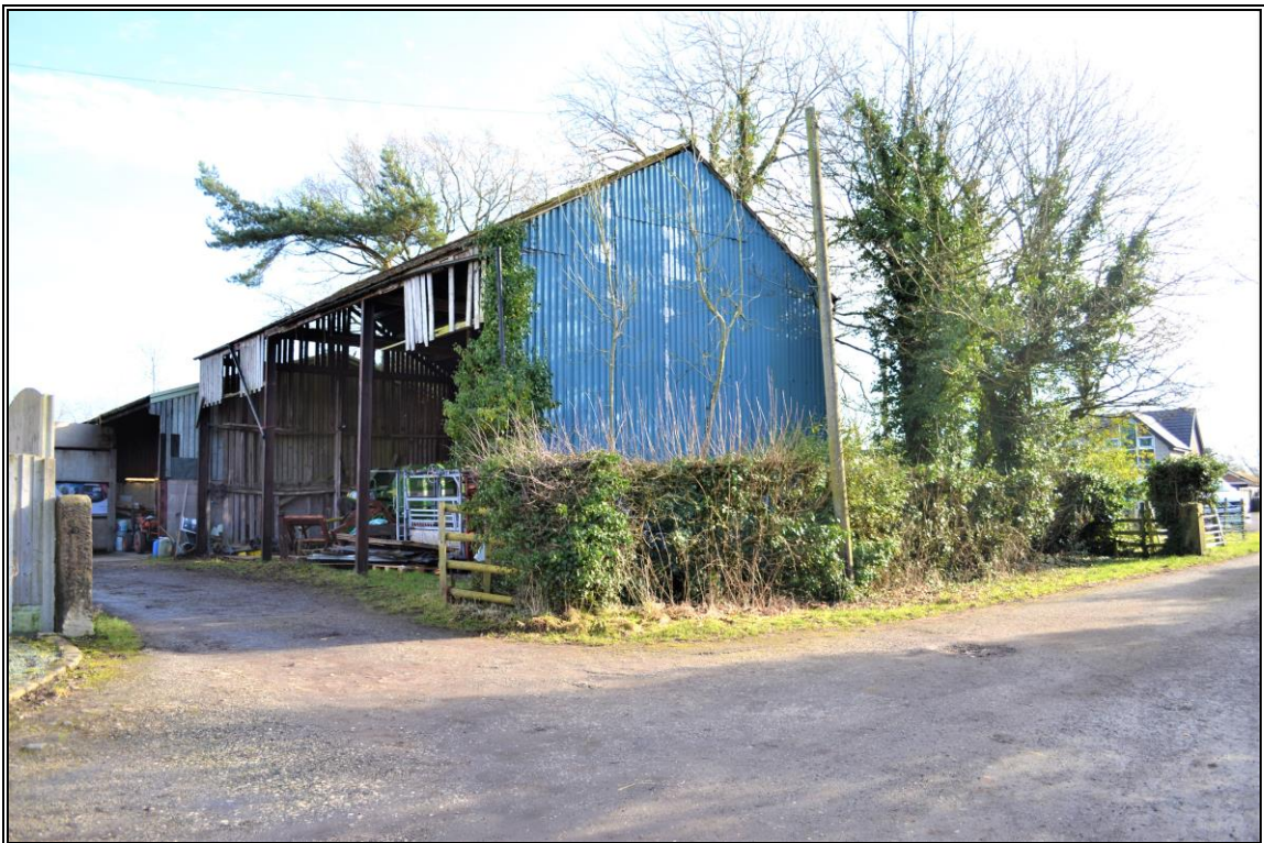
View of existing barn (to be demolished)