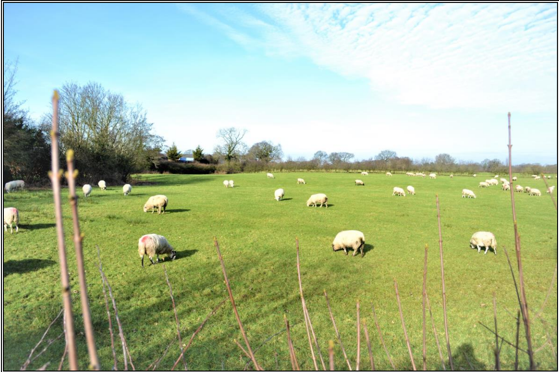
View of adjoining field