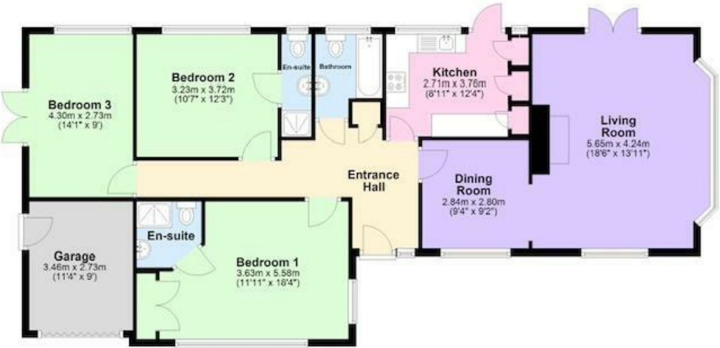
Total area: approx. 119.1 sq. metres (1282.4 sq. feet)