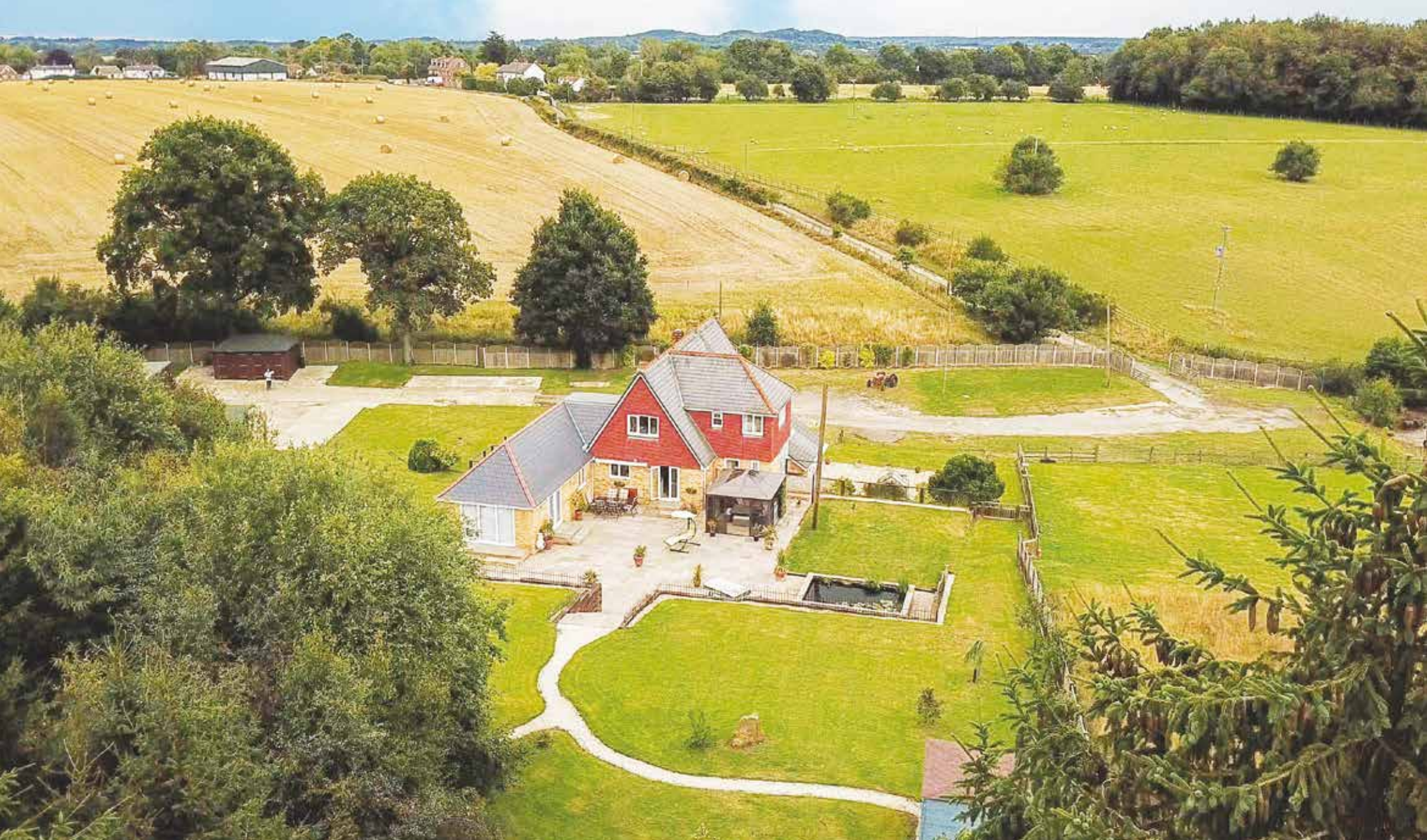
Oathill Farm Pound Lane | Molash | CT4 8HQ