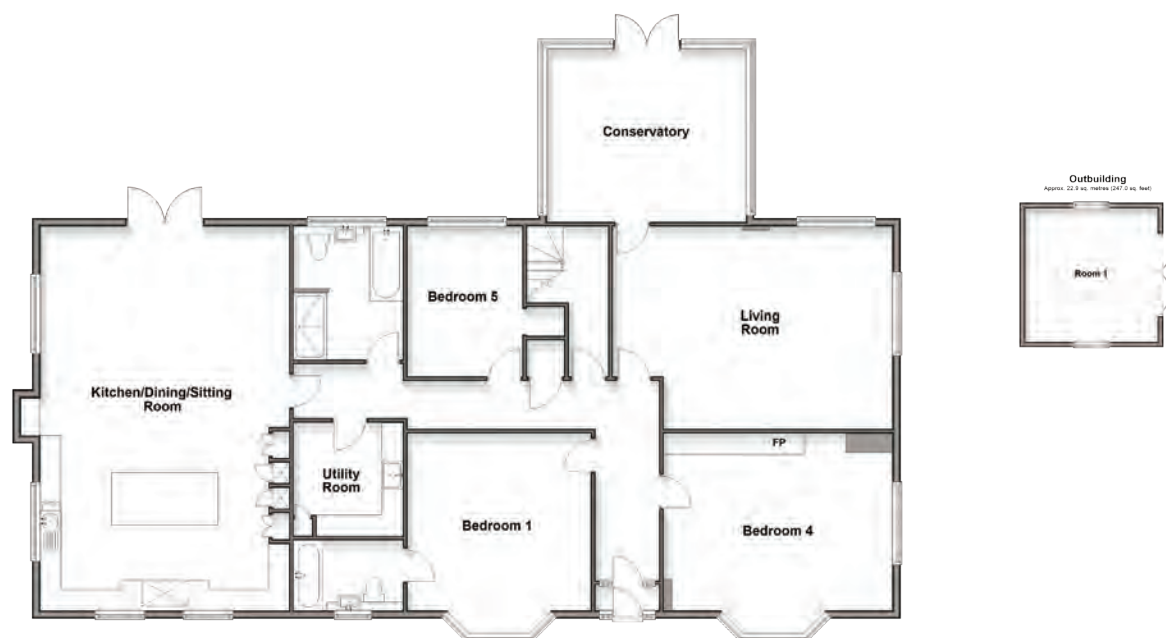
Ground Floor Approx. 209.6 sq. metres (2296.0 sq. feet)