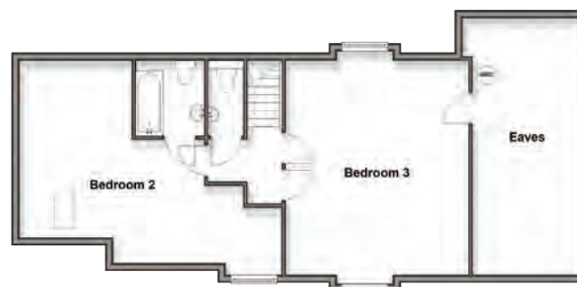
First Floor Approx. 80.6 sq. metres (867.2 sq. feet)

Wraparound Garden Driveway Greenhouse Workshop