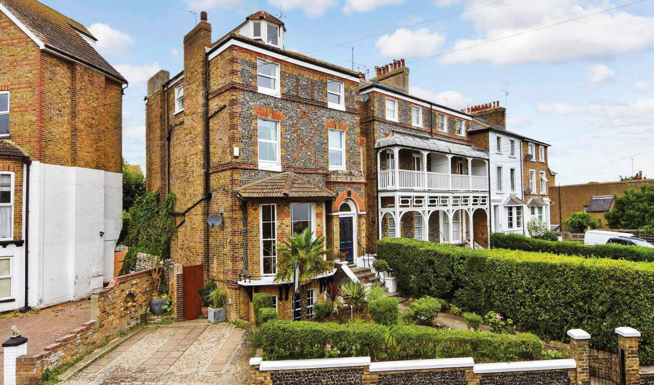
Broadstairs House 24 Ramsgate Road | Broadstairs | Kent | CT10 1PP