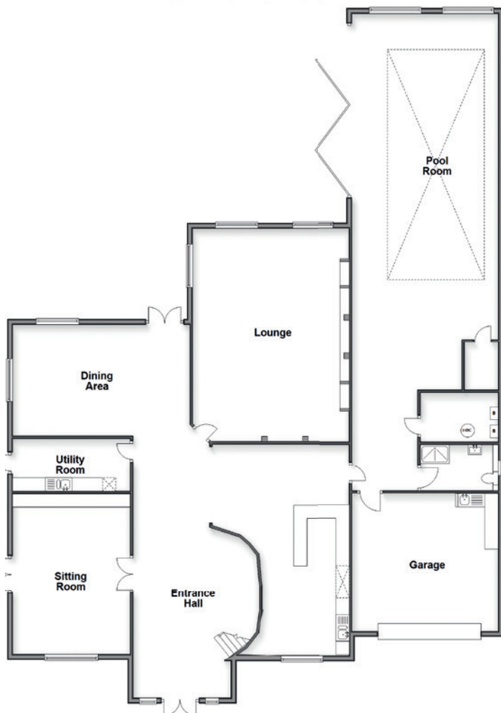
Ground Floor Approx. 310.4 sq. metres (3341.2 sq. feet)