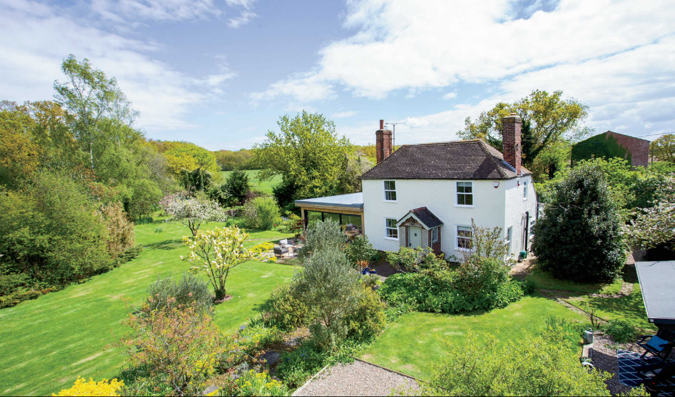
The Cottage Hicks Forstal | Hoath | Canterbury | Kent | CT3 4NA