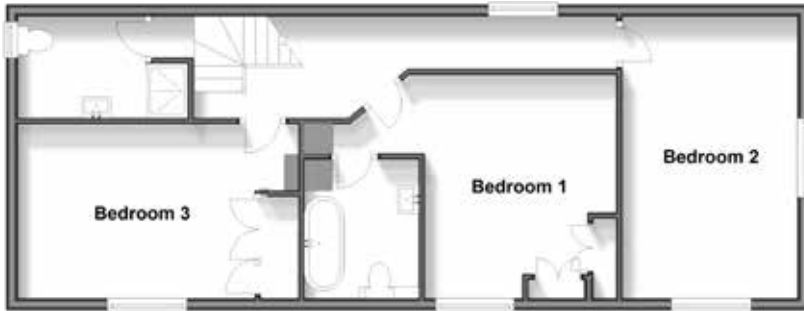
Split Level First Floor Approx. 66.1 sq. metres (711.4 sq. feet)