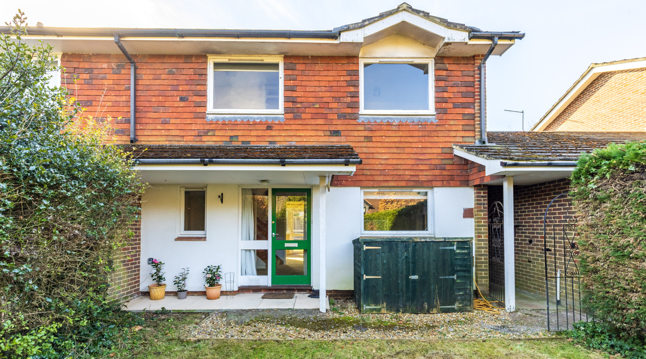
Orchard Cottages, Mill Lane, Bramley, Surrey.