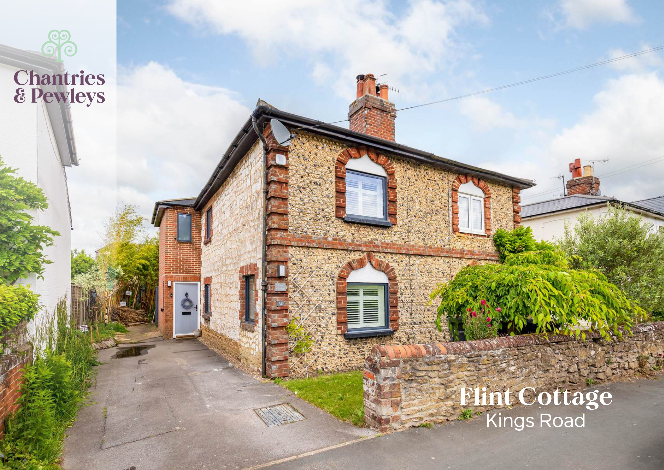
Flint Cottage Kings Road