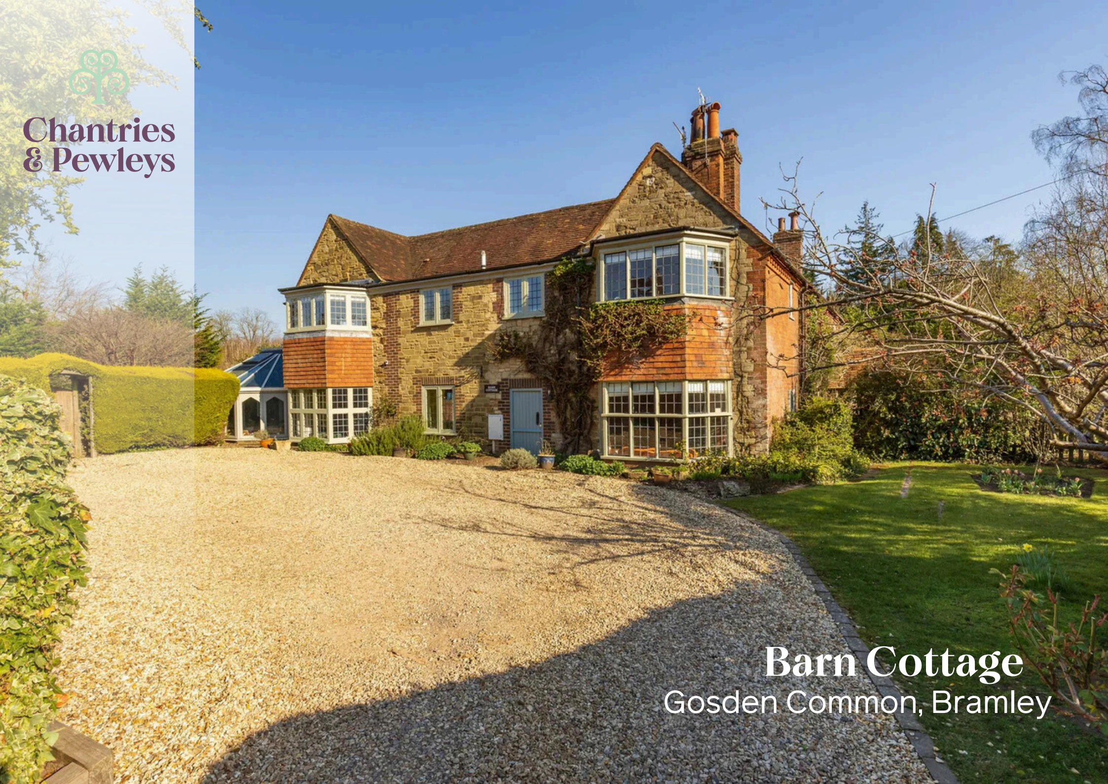
Barn Cottage Gosden Common, Bramley