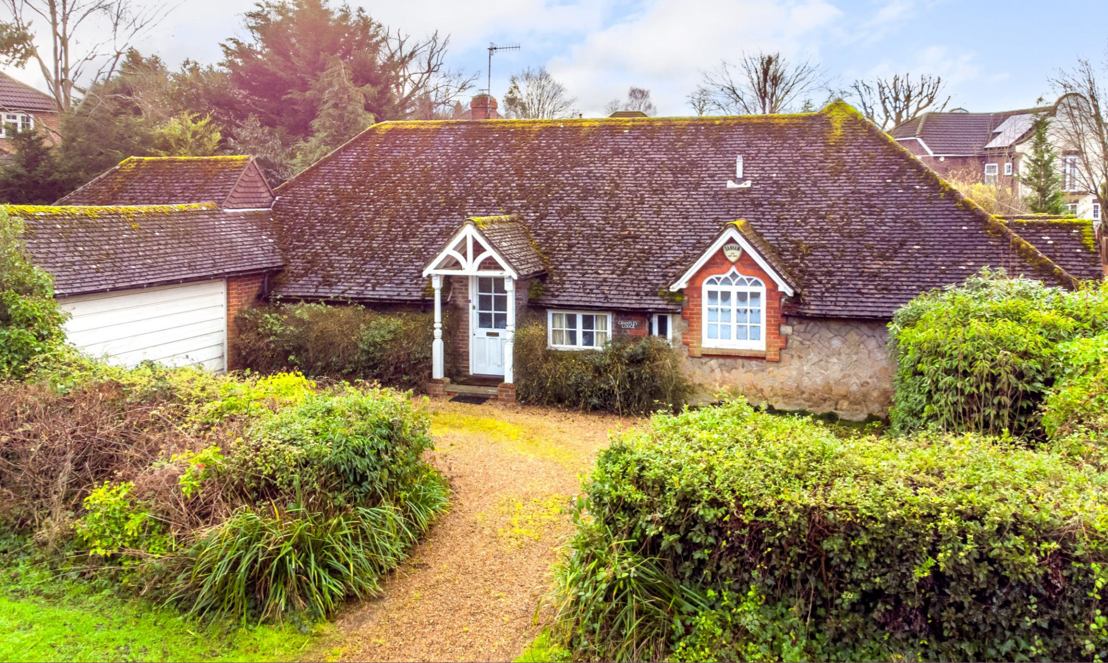
Grantley Lodge, Chinthurst Lane, Shalford, GU4 8JS