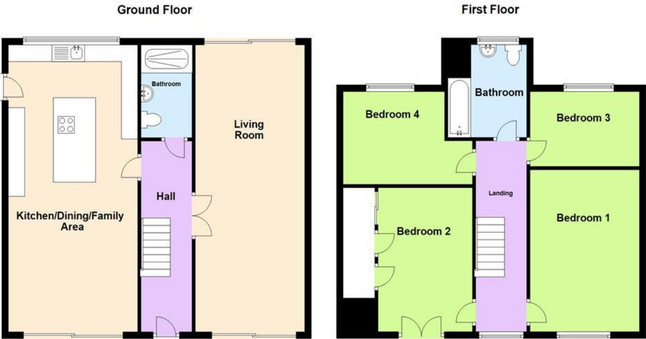
Total area: approx. 142.3 sq. metres (1531.9 sq. feet) Manningford

This floor plan is not drawn to scale and is for illustration purposes only