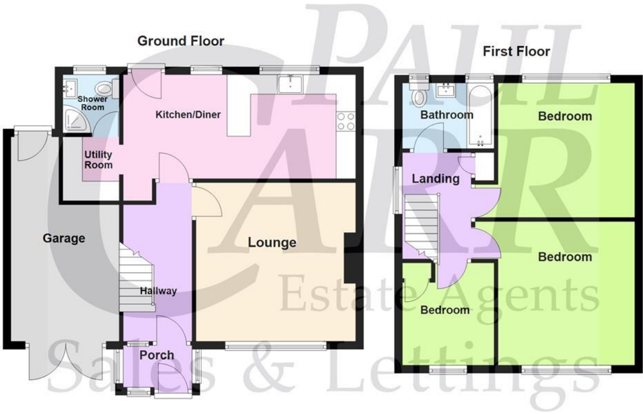
This floorplan is not drawn to scale and is for illustration purposes only Plan produced using PlanUp.

This floor plan is not drawn to scale and is for illustration purposes only