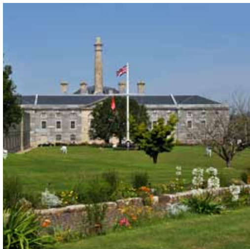
Top image - Saxton show apartment Bottom image - Mills Bakery, Royal William Yard