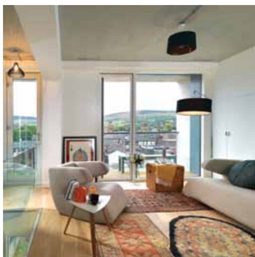
Top image - Chips, New Islington, Manchester