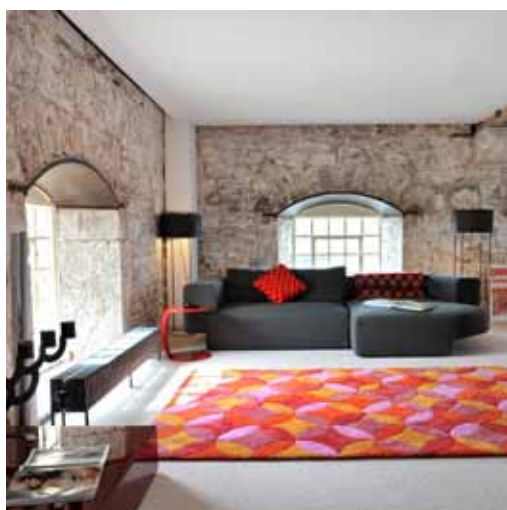
Top image - 3Towers, Manchester Bottom image - Mills Bakery, Royal William Yard, show apartment