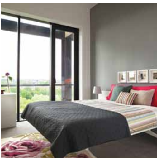
Top image - Pattern House, Longlands, Stalybridge Bottom image - Lakeshore show apartment