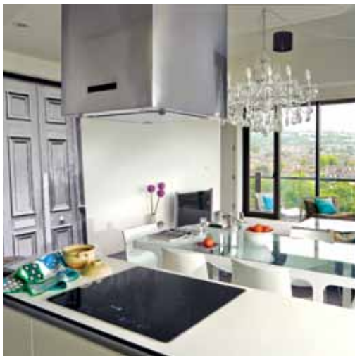
Top image - Saxton show apartment