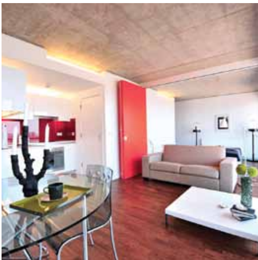
Top image - Saxton, Leeds Bottom image - Chips show apartment