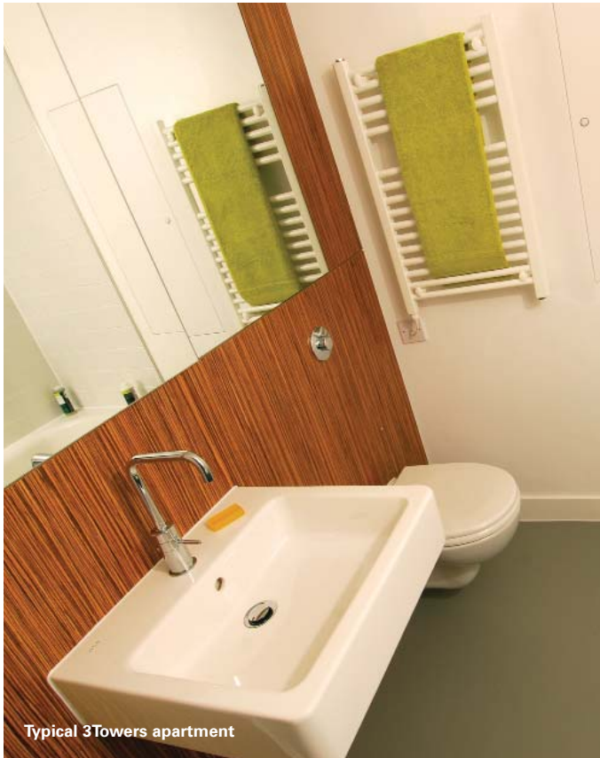
Typical 3Towers apartment