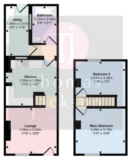
Ground Floor Approx 36 sq m / 385 sq ft