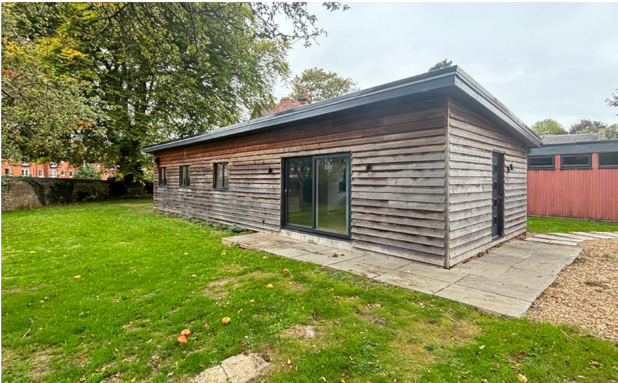
9 Bewick House, Denmark Road, Gloucester, GL1 3HW