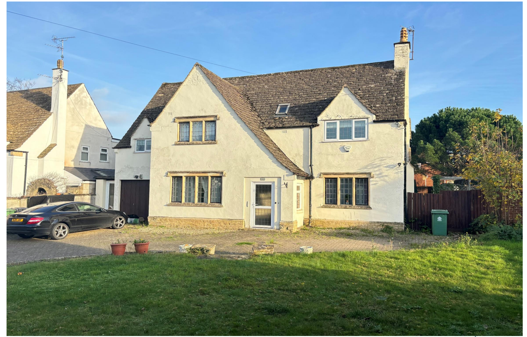
279 Stroud Road, Gloucester, Gloucestershire, GL1 5LB