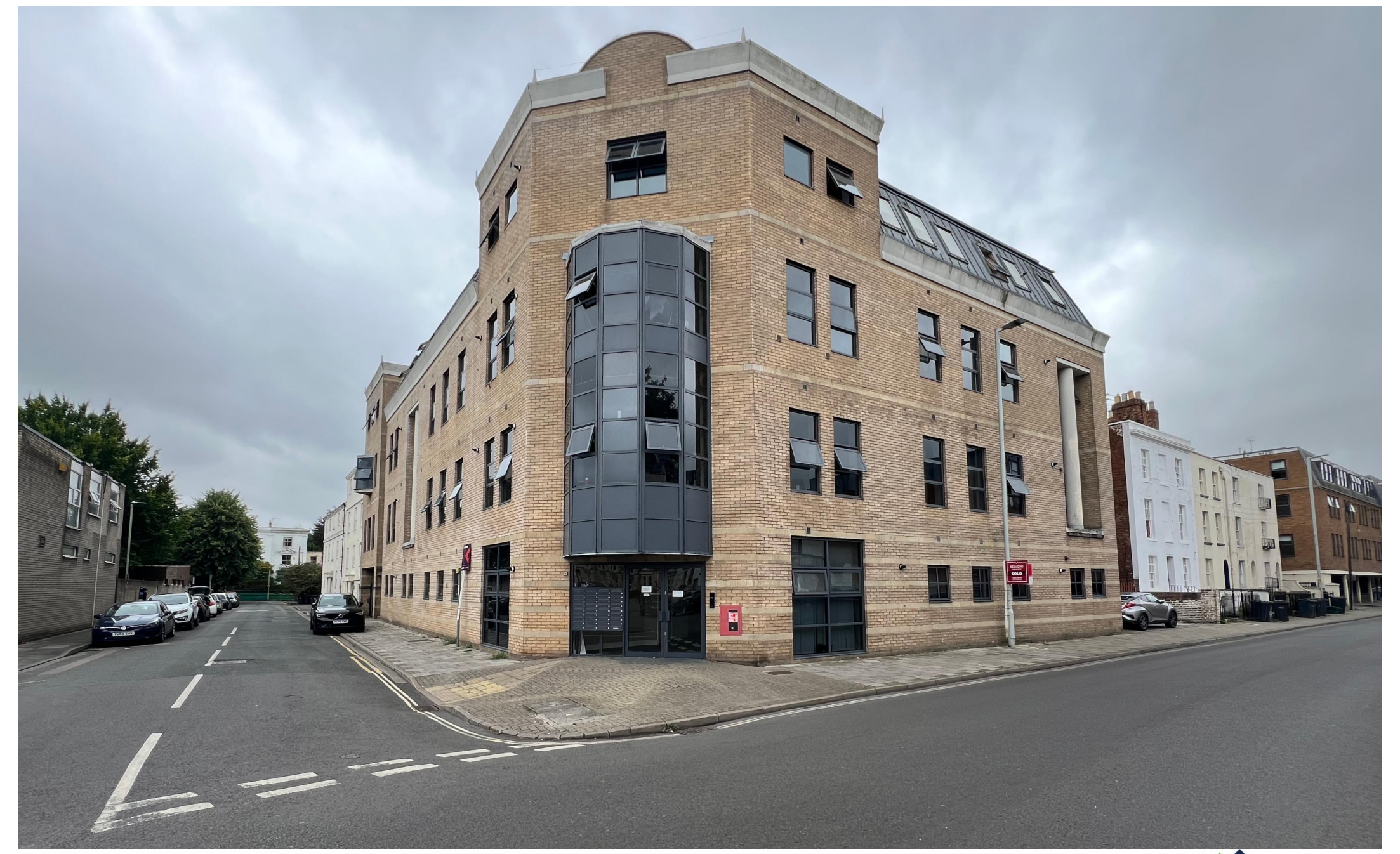
30 Fitzalan House, Park Road, Gloucester, GL1 1LW