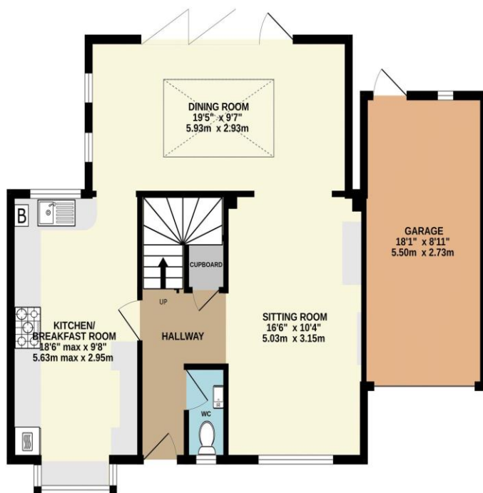
GROUND FLOOR 797 sq.ft. (74.1 sq.m.) approx.