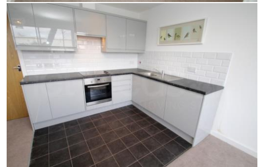
Twenty Twenty House Skinner Lane, Leeds, LS7 1BB