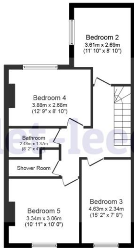
Second Floor Plan Floor area 55.0 sq. m. (592 sq. ft.) approx

This floor plan is for illustration purposes only and may not be representative of the property. The position and size of doors, windows and other features are approximate. Unauthorized reproduction prohibited.