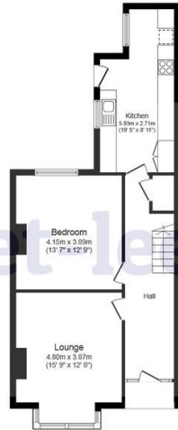
Ground Floor Plan Floor area 64.0 sq. m. (689 sq. ft.) approx

Total floor area 64.0 sq. m. (689 sq. ft.) approx