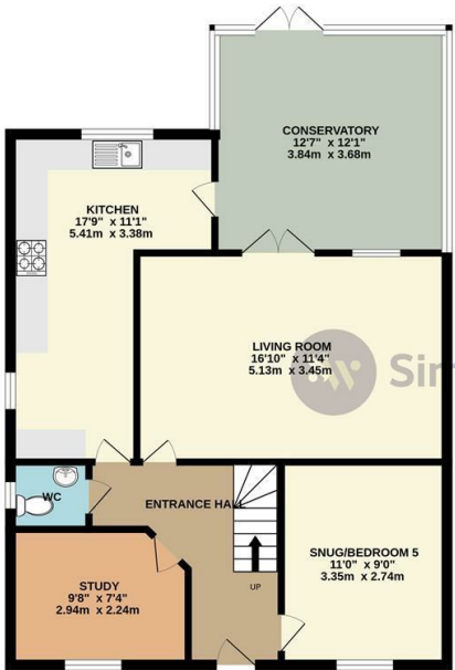
GROUND FLOOR 752 sq.ft. (69.9 sq.m.) approx.