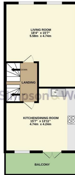
1ST FLOOR 501 sq.ft. (46.5 sq.m.) approx.