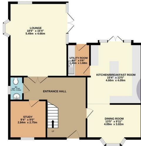
GROUND FLOOR 900 sq.ft. (83.6 sq.m.) approx.