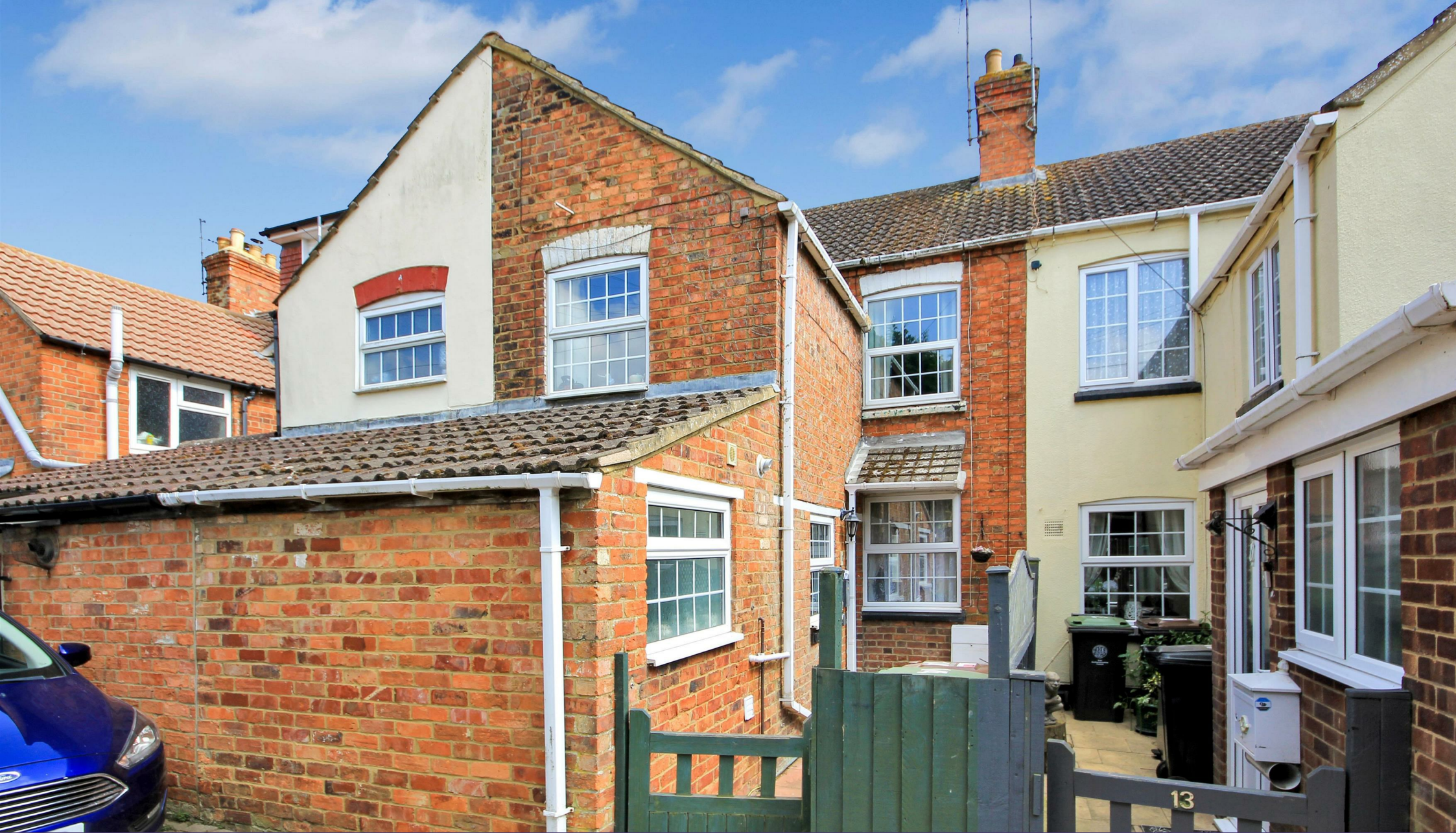
14. Co-operative Row Rushden, NN10 0RJ